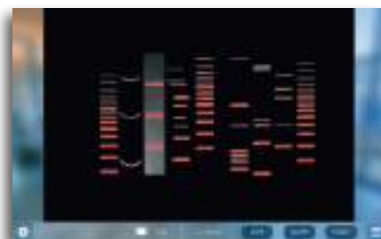
Visualize the saturation in live