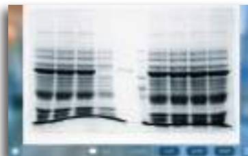
A large number of stains can be imaged