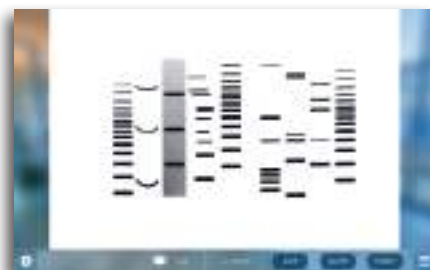
Inverse your image at your fingertips