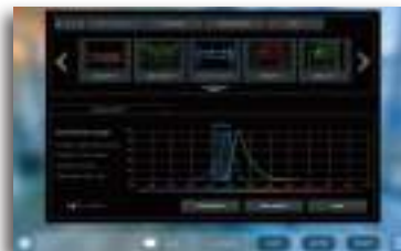
40 different application protocols

► The Apps Studio contains the excitation and the emission spectra of the main fluorophores used in modern molecular biology laboratory. It also suggests the best possible system configuration in terms of light source excitation, emission filter and sensitivity level. The Apps Studio ensures reproducibility and one click image acquisition for the best ease of use.