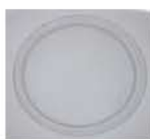
colony dish image