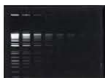
ECO Safe staining