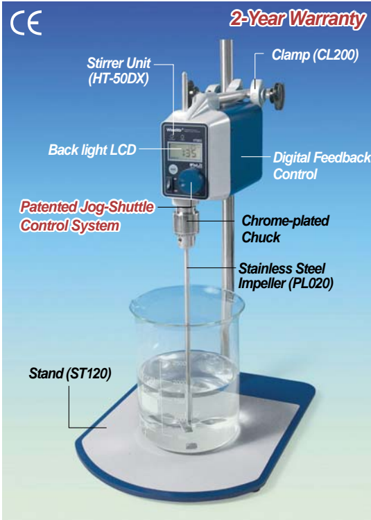
High-Torque Digital Overhead Stirrer, “HT-50DX” Package-set