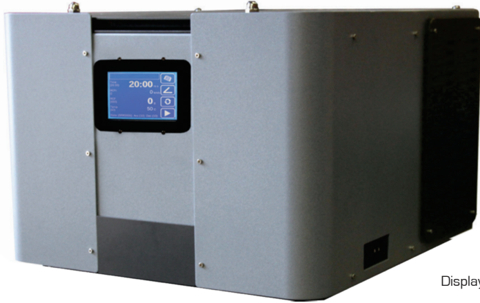
Display indicative only

Speed max.....500-4000 Rpm (1 Rpm steps) Rcf max.....4200 G Timer .....0-9999 Mins & Hold (1 sec steps) Dimensions.....HWD 315 x 450 x 635mm