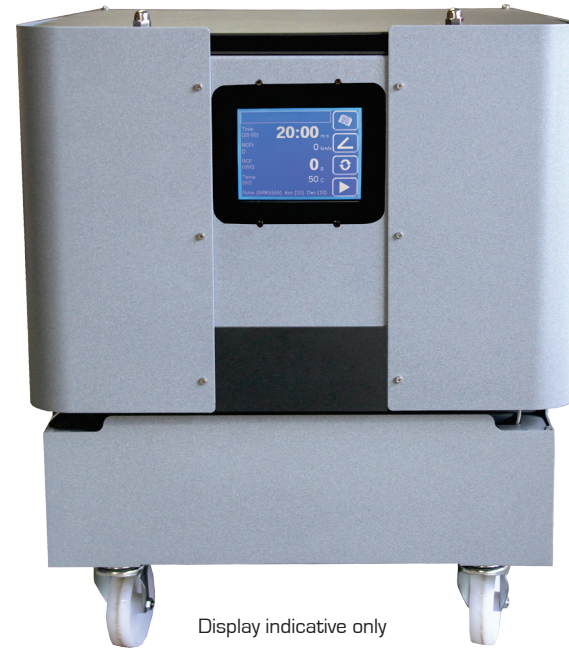
Display indicative only

Weight.....62.2 Kg (without rotor) Power.....600 Watts Memory.....108 programs Accel rates.....10 programs Decel rates.....10 programs Temp..... Ambient to 90°C PID Controlled to + / - 2°C 20-40 Controlled to + / - 1°C 50-90