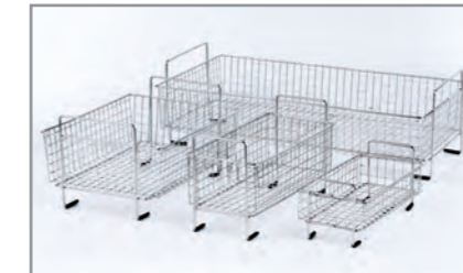
Basket Ideal for small parts (Optional accessory)