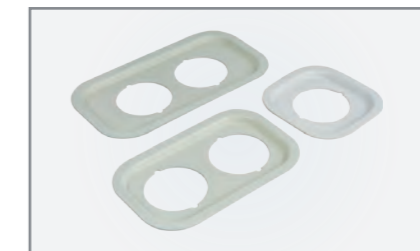
Beaker positioning cover Used to position beaker for indirect cleaning (Optional accessory)