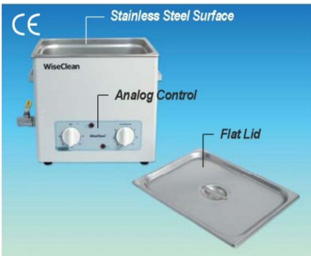
Analog Ultrasonic Cleaner “WUC-A06H” with Flat Lid