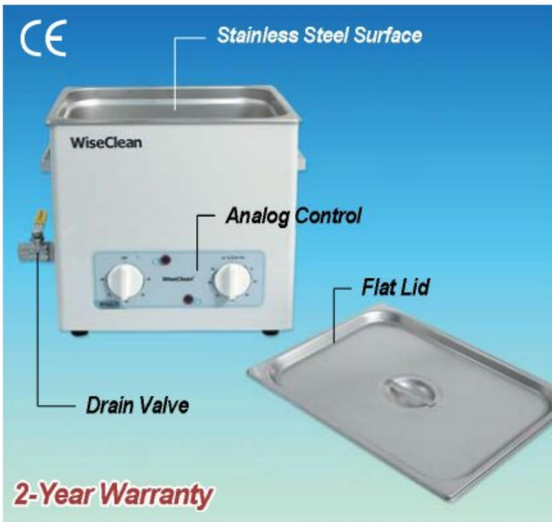
Analog Ultrasonic Cleaner “WUC-A10H” with Flat Lid