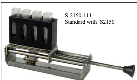
S-2150-111 Standard with S2150